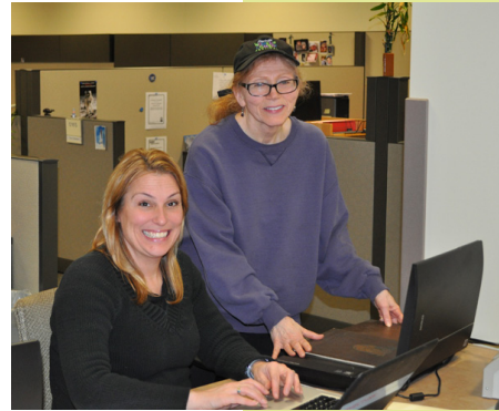
Students digitizing at the scanner.